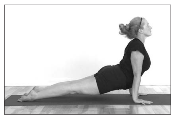
Urdhva Mukha Svanasana (5-10 breaths x 2)