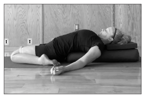
Supta Virasana (3-5 minutes)