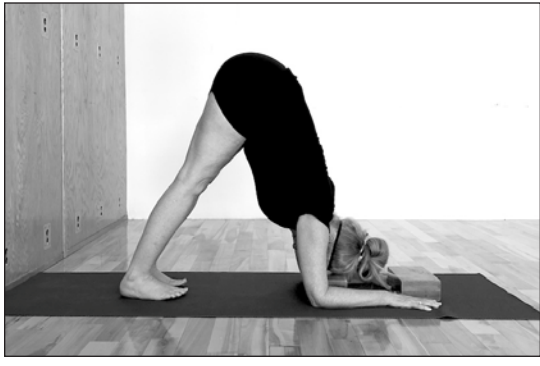
Pincha Down Dog (5-10 breaths x 3)

Adho Mukha Vrksasana walking up the wall (5-10 breaths) Repeat sequence 3x