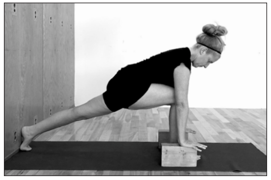
Lunge back foot at wall (10 breaths each side)