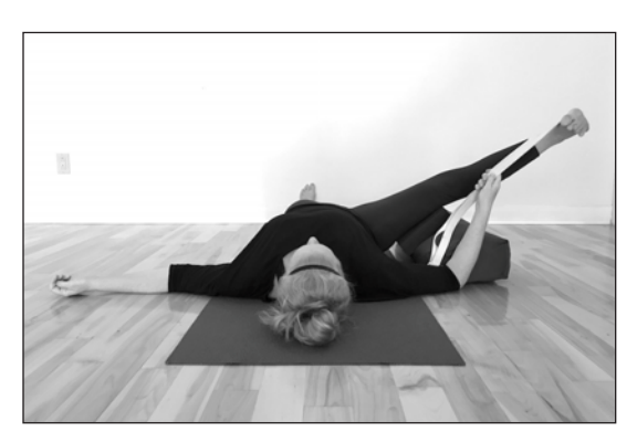
Supta Padangusthasana B Right side (10-15 breaths) Repeat both on the Left side