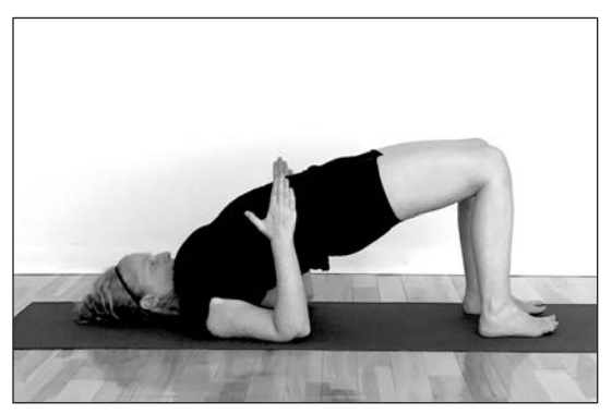
Setu Bandha (5-10 breaths x 2)