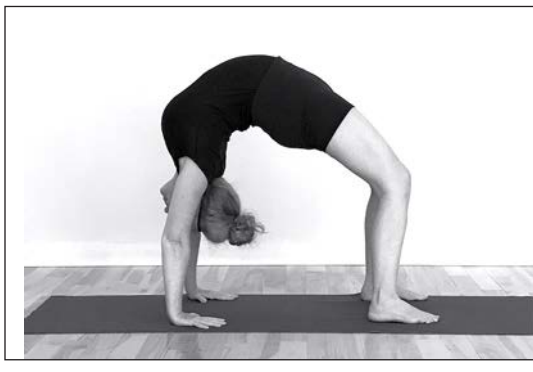
Urdhva Dhanurasana (5-10 breaths x 2)