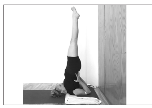
Salamba Sarvangasana (3-5 minutes)