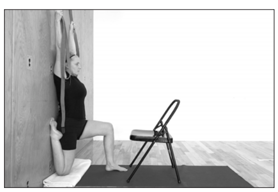
Urubangasana variation 1 (10-15 breaths each side)