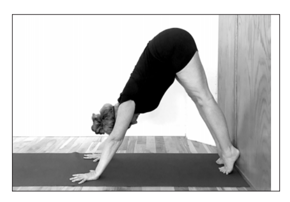
Adho Mukha Svanasana at wall (5-10 breaths) to \rightarrow