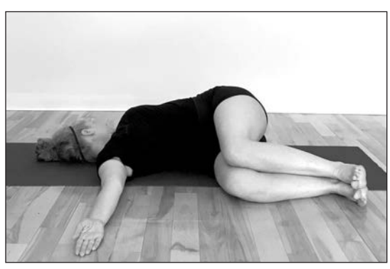
Jathara Parivartanasana (15 breaths each side)