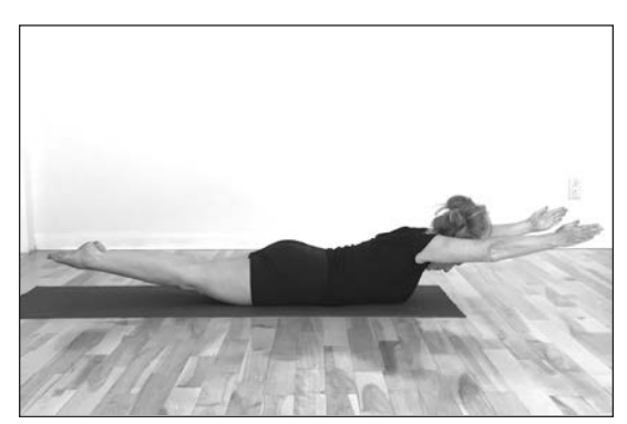
Salabhasana (5-10 breaths x 2)